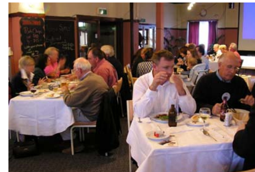
A big crowd for the GSE team