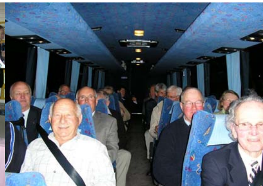
Luxury Travel to Bredbo