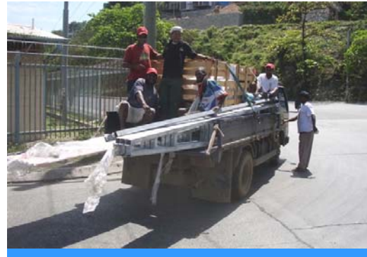
Tank is loaded at Port Moresby