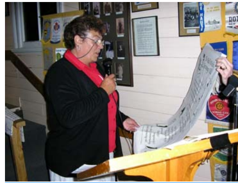
Heather throws in the towel!