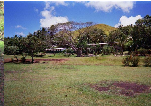
School at Kemabolo