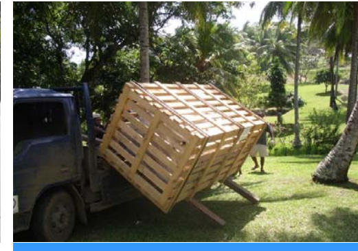
Tank is unloaded at Kemabolo