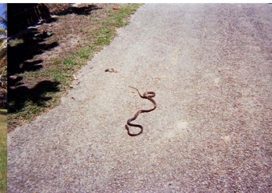
Something for lunch!