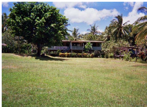
Teachers homes at Kemabolo