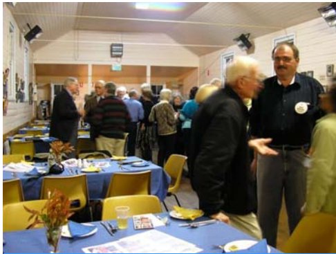
Bredbo Hall was crowded with members and guests