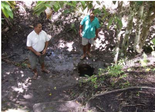
The tank will reduce the need to take water from these sources