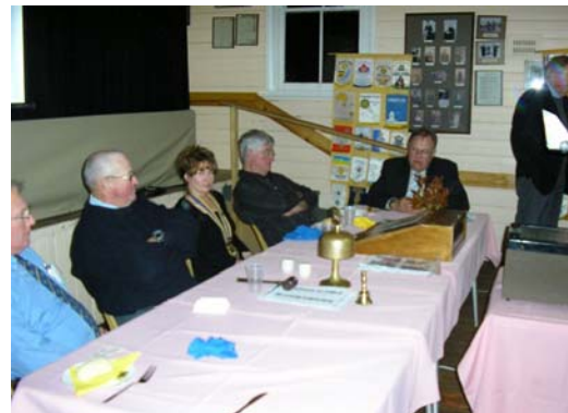
The Presidential table