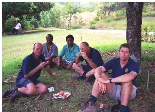
Lunch with the village leaders