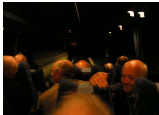
Who needs a flash with all this reflection