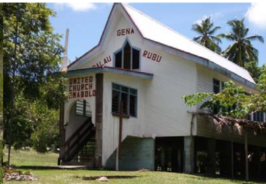
The Church at Kemabolo