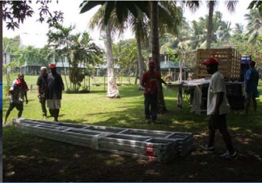
The tank is unloaded at Kemabolo