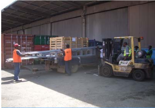
The tank is loaded at the docks