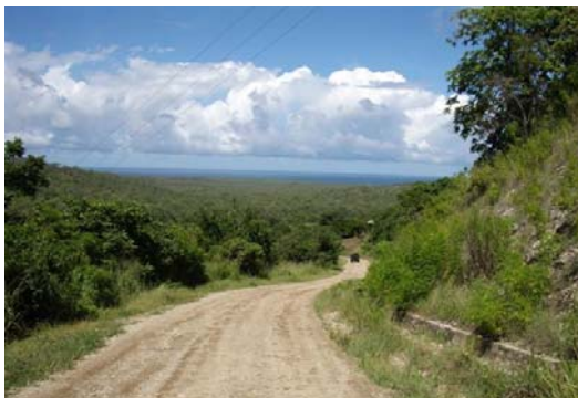
The drive in to Kemabolo