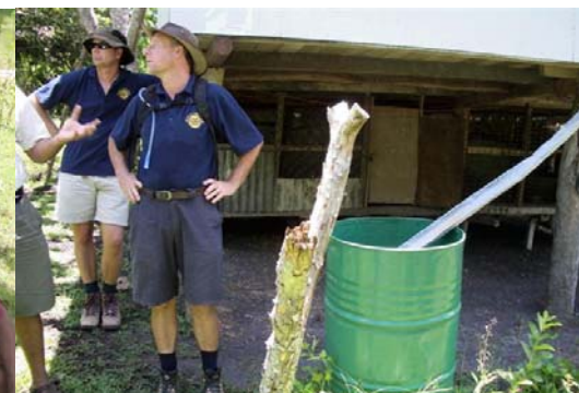
Household water storage