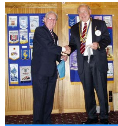
The banner swap!

Cooma club members attended the Rotary Club of Eden's Annual Changeover dinner on Saturday, 7 July. Rumour has it that all were well behaved and had a very pleasant evening renewing old friendships and reliving Rotary times.