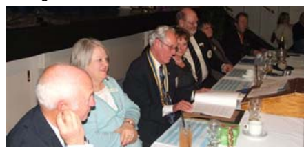
The Official Table