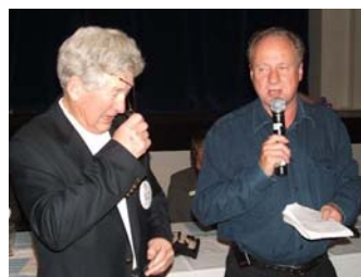
The Old and the New!!!!