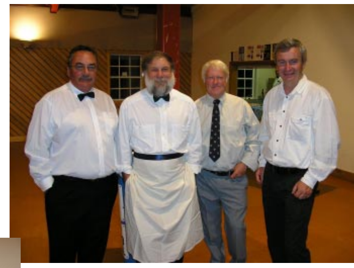
The members of Lions who ably looked after the liquid refreshments