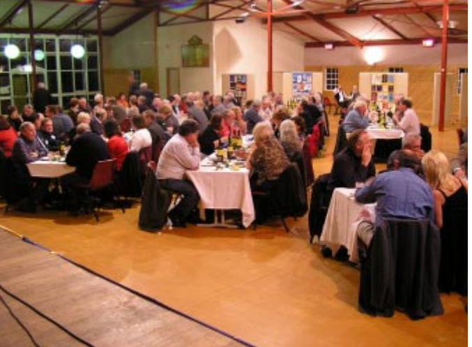
General view of the diners at the Multi Function Centre on Saturday night