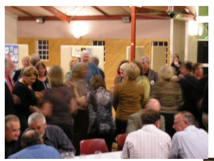
Assembly Night Entertainment 2007