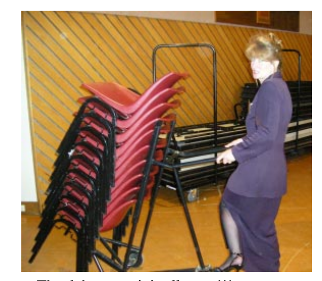
Thank heavens it is all over!!!