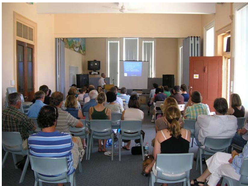
Part of the Group at the weekend GYE Briefing at St Pat's on Saturday