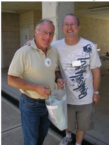
Two well known "Lads" having fun