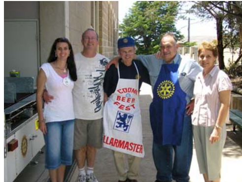
Our group of happy helpers enjoying the break from their chores on Saturday at the GYE Briefing at St Pat's