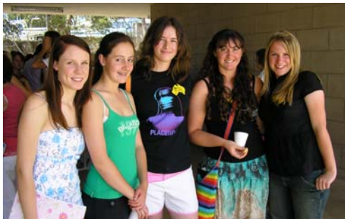
A group of happy students at the tea break