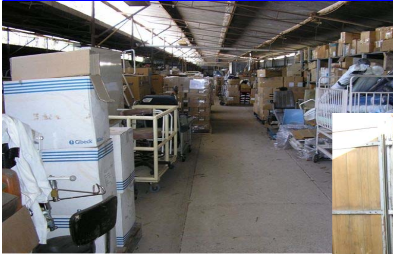
A view of the storage space and gear stored at the depot in Sydney for "Goods in Kind"