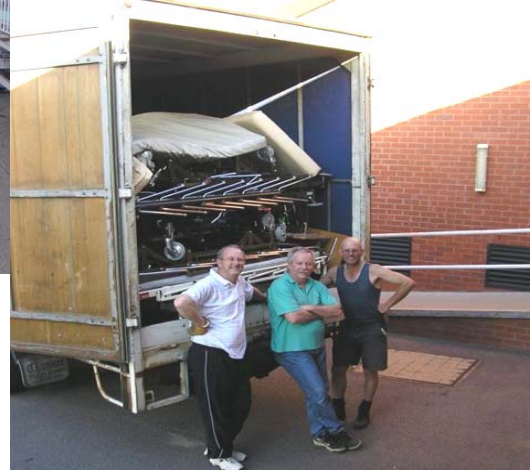
The "Workers" who did such a great job with the gear from the Hospital for "Goods in Kind"