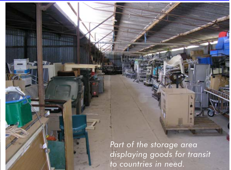
Part of the storage area displaying goods for transit to countries in need.