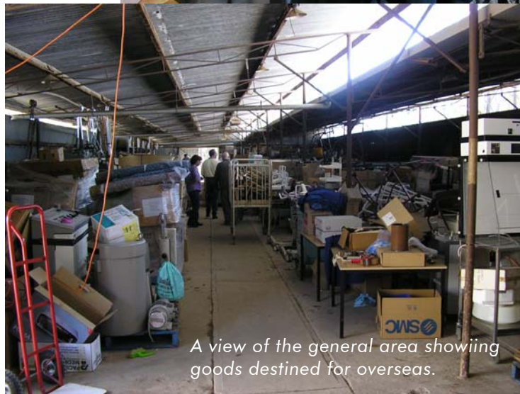
A view of the general area showing goods destined for overseas.