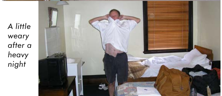
A little weary after a heavy night