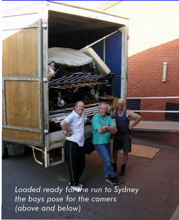
Loaded ready for the run to Sydney the boys pose for the camers (above and below)