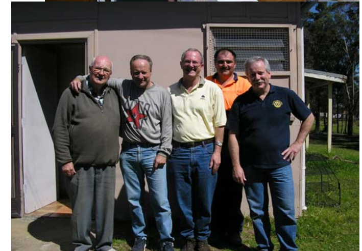
The happy group seen here with the resource manager