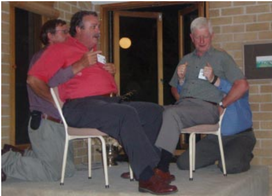
Tuggeranong's Puppets doing their performance (offering alms?)