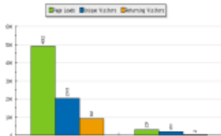
Visitors to the Web Site (See story on page 3)