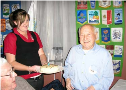
Belated but boisterous birthday tune.