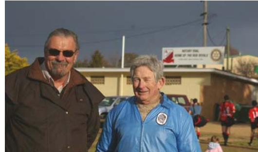
New Signage at Rotary Oval