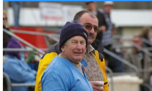
Noddy and Big Ears