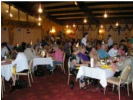
The Dining Hall with part view of guests