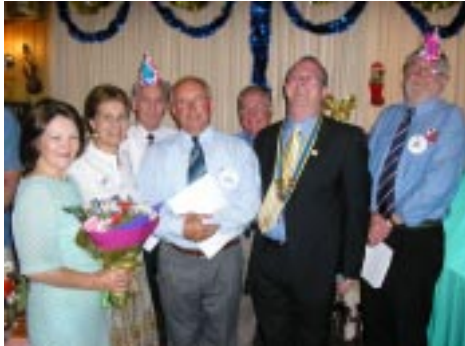
All smiles and relief, the job is done!